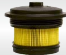
The new WIX 33818 filter kit.

These changes are being made as part of an ongoing product strategy that focuses on innovation and continuing product improvement.