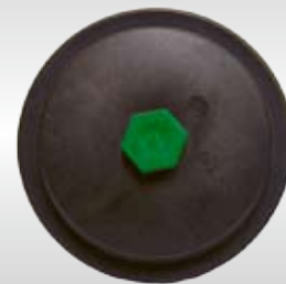
The new WIX 33818 with molded hex nut highlighted in green for demonstration purposes.