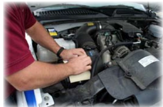
Improved ease of installation.