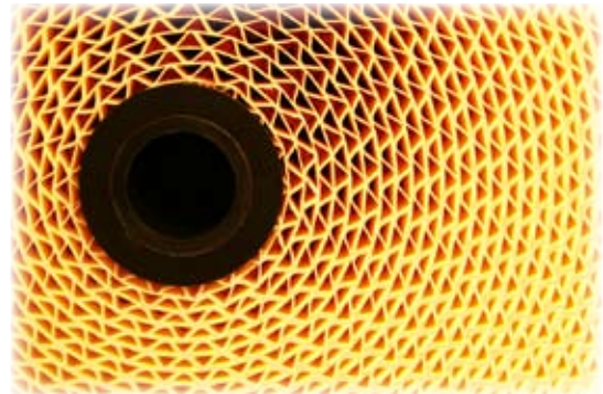
New polymerized phenolic impregnated media.