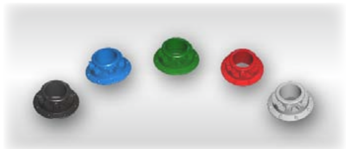
Figure 2.0 The innovative up-front combination valve